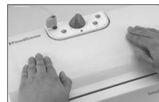
Press and Release Lid