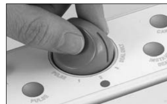
Set Seal Control Switch