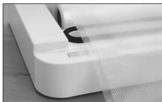
Pull Out Bag Material