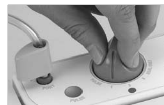
Set Seal Control Switch