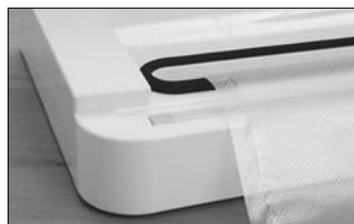
Place Bag in Vacuum Channel