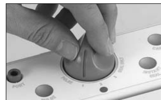
Set Seal Control Switch