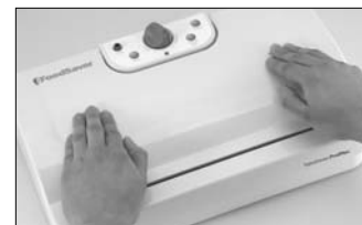
Press and Release Lid