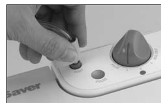
Insert Accessory Hose